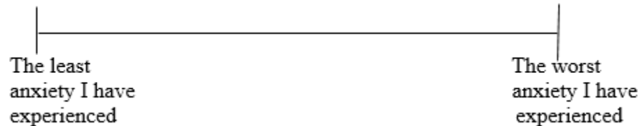
Visual Analog Scale (VAS)